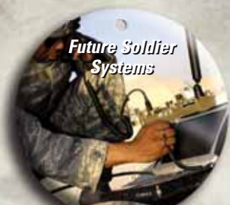
Future Soldier Systems

Fischer UltiMate™ Original Series is ideal for defense and security applications