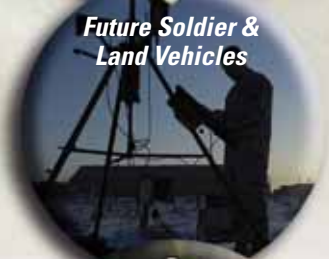
Future Soldier & Land Vehicles